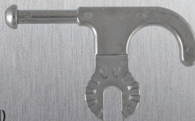
Disconnect Hook for attachment to Sunrise Fitting

STANDARD ELECTRIC WORKS CO., LTD. www.sew.com.tw