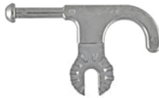
HOK-HS166 Disconnect hook (Optional)