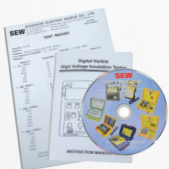
Test report Instruction manual CD