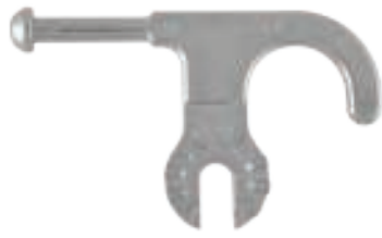
Disconnect hook (HOK-HS166)