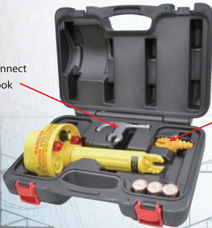
• Carry case (TOC-278)